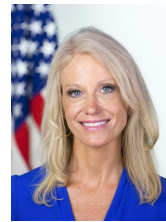
Kellyanne Conway Former Assistant to the President and Senior Counselor to the President at the White House