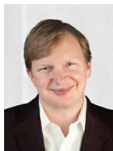
Jim Messina CEO The Messina Group