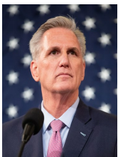
Kevin McCarthy 55th Speaker of the House