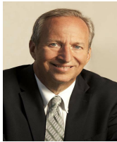
Lawrence H. Summers Former President of Harvard and Treasury Secretary

Our 14th Annual Investment Conference will highlight important investment trends, large and small, driving the economy and the markets. If you are interested in attending, please be sure to reach out to your Strategas salesperson at 212-906-0130.