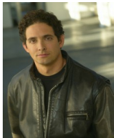
Alex Berenson Winner of the Edgar Award and #1 New York Times Best Seller